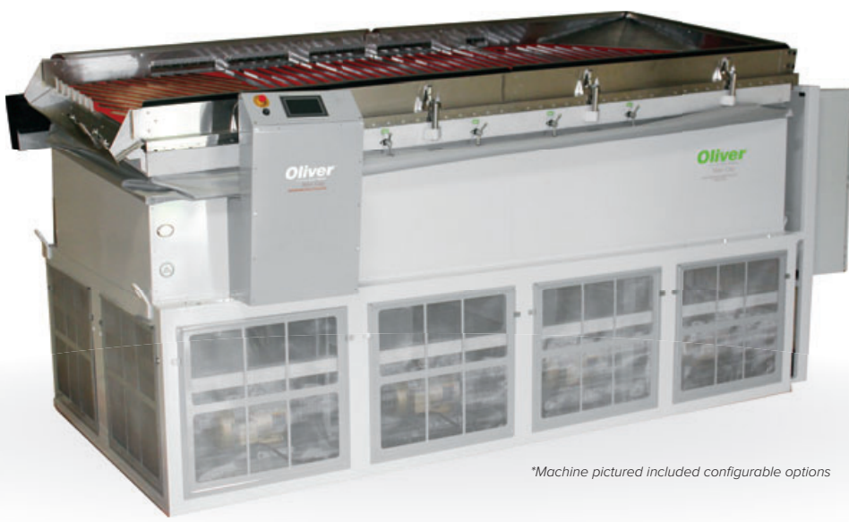
*Machine pictured included configurable options