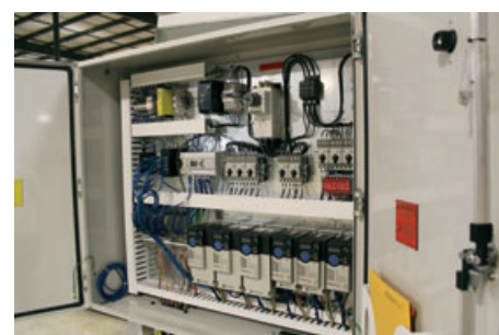
Built with the power to perform

What else can your Oliver do? Find out at olivermanufacturing.com .