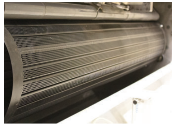
Roller cleanout system