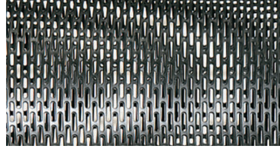
Slotted conical cylinder

Options include: vibratory conveyor, manual or pneumatic roller cleanout system, stainless steel contact points, stackable modular design options for multiple size grading, and custom door options.