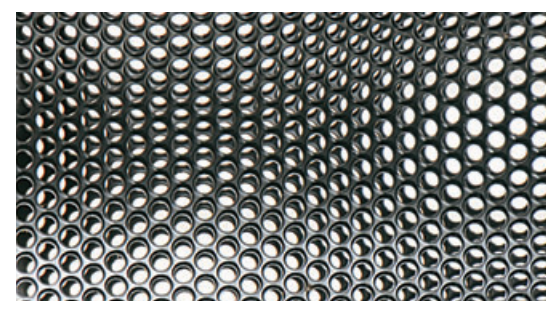
Round conical cylinder