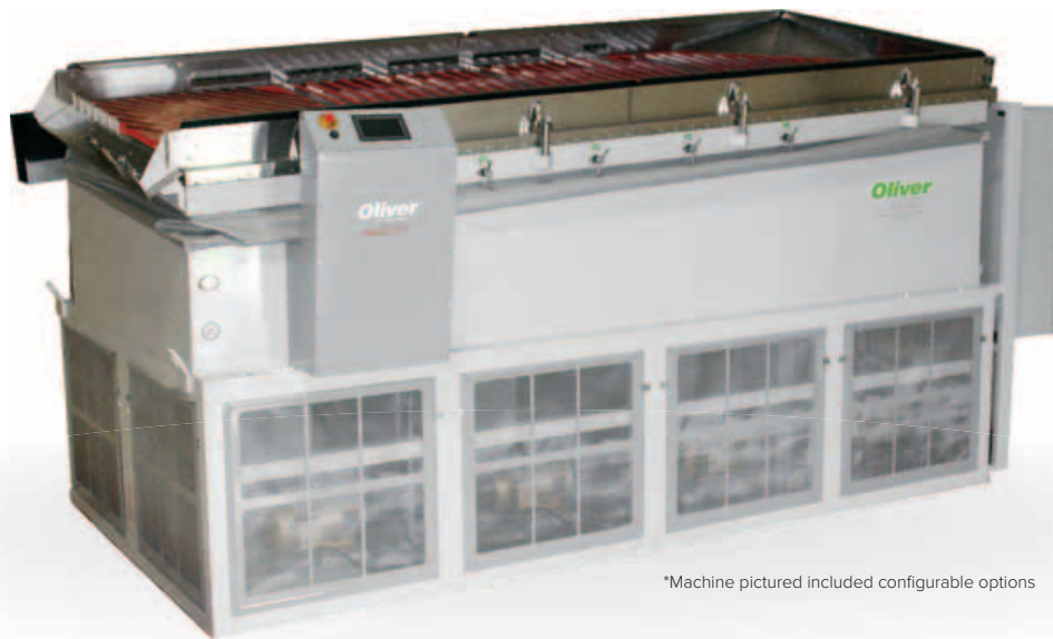
*Machine pictured included configurable options