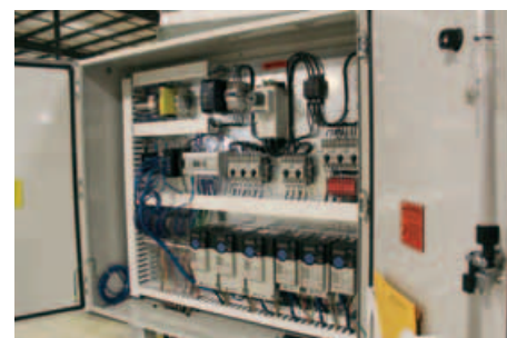
Built with the power to perform

What else can your Oliver do? Find out at olivermanufacturing.com .