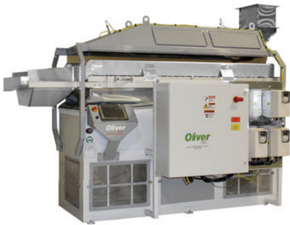
DVX 307 / Scalp screen option