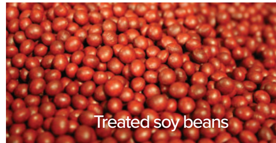
Treated soy beans