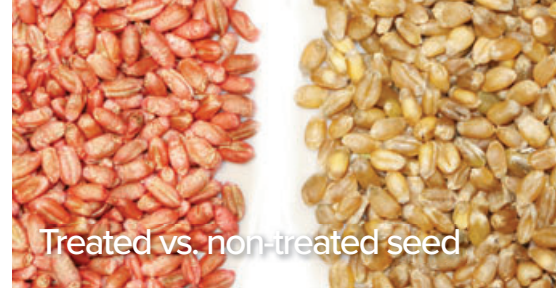
Treated vs. non-treated seed