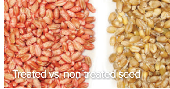
Treated vs. non-treated seed