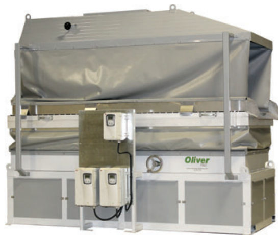
Oliver FBD 410 Dryer

* Temperature and humidity can cause capacity variation