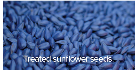
Treated sunflower seeds