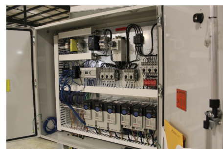
Built with the power to perform

What else can your Oliver do? Find out at olivermanufacturing.com .