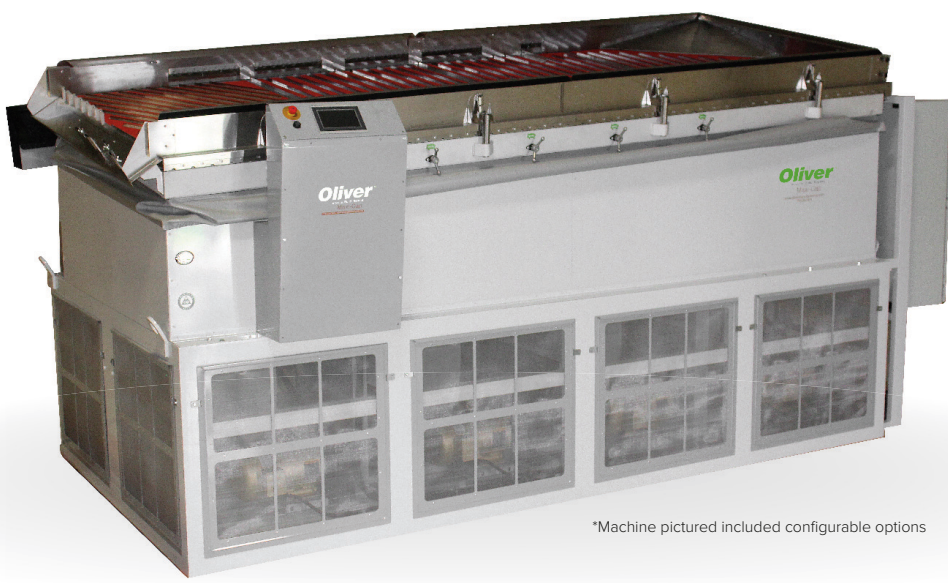
*Machine pictured included configurable options